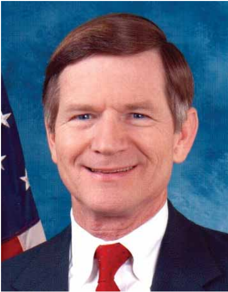
Rep. Lamar Smith (R-TX)

being unable to prevent major drug manufacturers from keeping generic equivalents off the market. Both major presidential candidates in 2008, Sen. Barack Obama, D-Ill., and Sen. John McCain, R-Ariz., have indicated they seek to eliminate these loopholes. Indeed, McCain, along with Sen. Charles Schumer, D-N.Y., in 2001 sponsored legislation (which passed in July 2002) designed to do just that. 106 In the current 110th Congress, Reps. Howard Berman, D-Calif., and Lamar Smith, R-Tex., have co-sponsored the Patent Reform Act (H.R. 1908), passed by the full House in September 2007 by a 225–175 margin. 107 The product of numerous hearings and working groups, the measure would expand opportunities for patent infringement—and without recourse by the patent-holder to sue for compensation. One of the bill's key provisions would require every patent application to be published on the Internet within 18 months of filing. 108 This overlooks reality, particularly in the pharmaceutical industry. The time elapse between the filing of a patent application and its approval is typically longer, often twice as long as in industry generally. Even with-