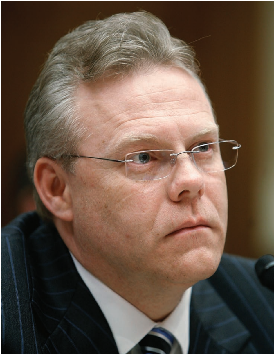
Chrysler CEO Tom W. LaSorda: “We’ll kick their ass.”