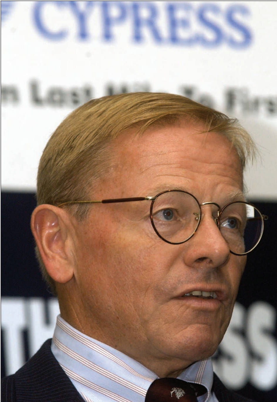
Cypress Semiconductor CEO T.J. Rodgers stood up to Jesse Jackson.

Information technology firms also have gotten aboard the diversity bandwagon. At the turn of the decade they capitulated virtually without complaint to Rev. Jesse Jackson and his Rainbow/PUSH organization's Silicon Valley Project. The group boasts: 28