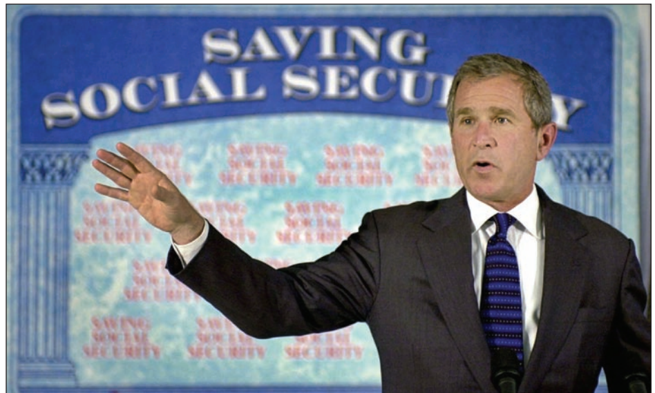
President Bush's "60-cities-in-60 days" speaking tour promoting the merits of private accounts failed to counter the AARP scare campaign.

These agencies appear to be the consistent sources of federal funding for AARP. It has been getting SCSEP funds since 1969 and TCE grants since 1979. In a March 2001 letter to HHS on federal financial assistance, the AARP Foundation reported that it received money from DOL, the IRS, HHS, HUD and DOJ.