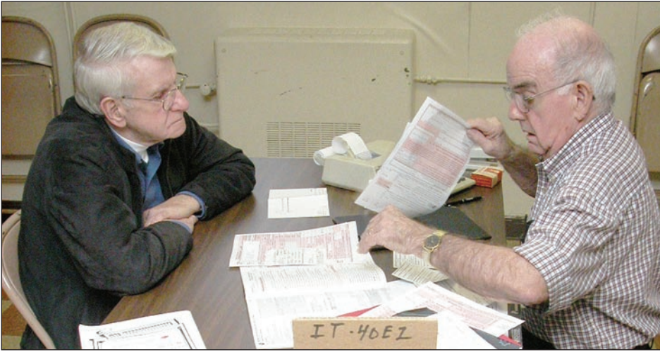
Some experts believe AARP may be exaggerating the number of senior citizens it assists in preparing their income taxes.

The AARP Tax-Aide program, which administers the TCE grant, was established in 1968. AARP claims that each year its 32,000 volunteers provide free tax service to 1.9 million people, the nation's largest free tax preparation service.