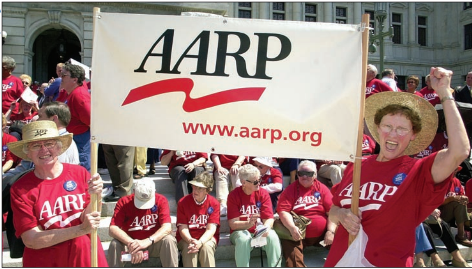
AARP claims it has 1.5 million activist members who can be mobilized into action in every congressional district.

since the nonprofit organizations, among the best-funded in the nation, are quite capable of bearing the expenses of running senior training programs. In its official Budget Options report to the House and Senate Budget Committees in March 2003, the CBO noted that under current law AARP and other nonprofits must bear only 10 percent of the job training costs. CBO concludes, “Shifting those costs would ensure that only the services that were most highly valued would be provided.” In other words, nonprofits would do a better job with their own money.